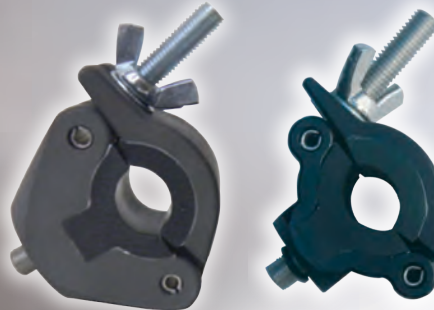
Black Iron Master