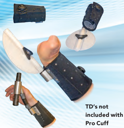
TD's not included with Pro Cuff