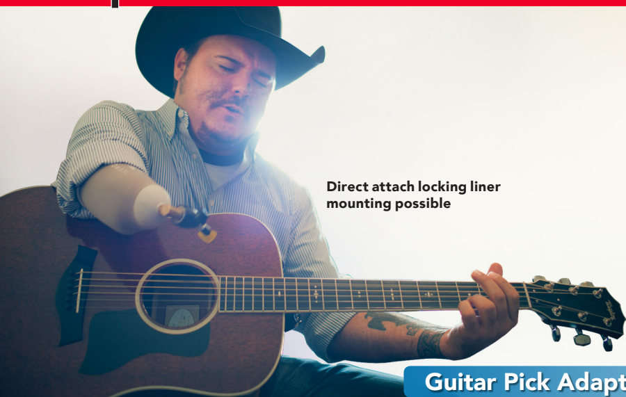
Direct attach locking liner mounting possible