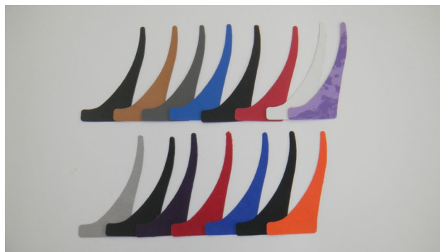
Please choose from below selection

SELECT 2 nd EXTRA Inlay** set color/material: #GP5IL0(____)