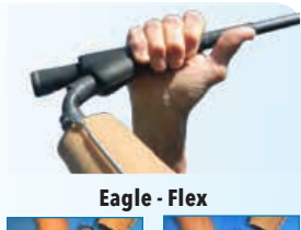
Eagle - Flex