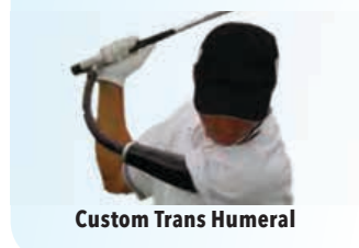
Custom Trans Humeral