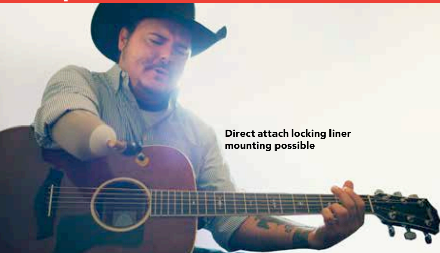
Direct attach locking liner mounting possible