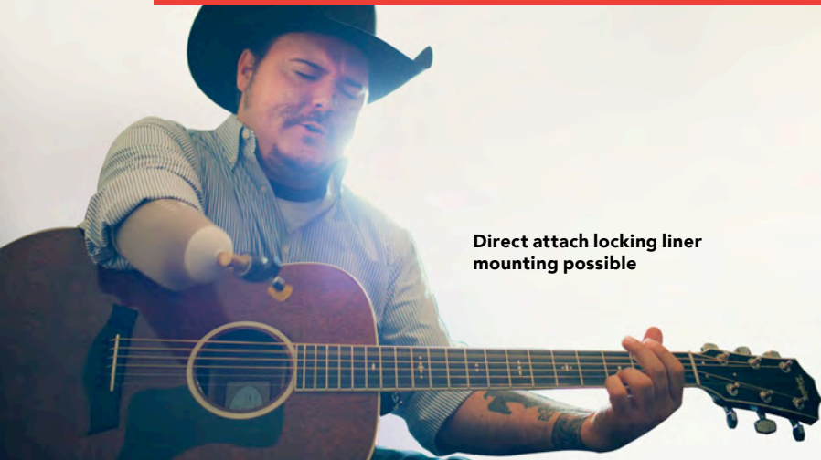
Direct attach locking liner mounting possible