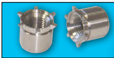
OM003 Omega Disconnect Inserts