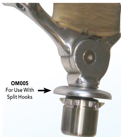
OM005 For Use With Split Hooks