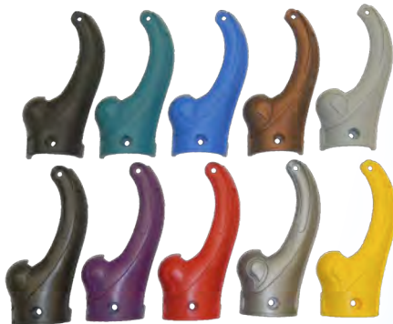
Injection molded Outer Shells