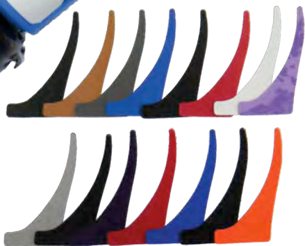
Color Inlays (Self-Adhesive)